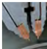
Narrow welding head