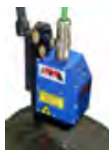
Scanning laser tracking sensor