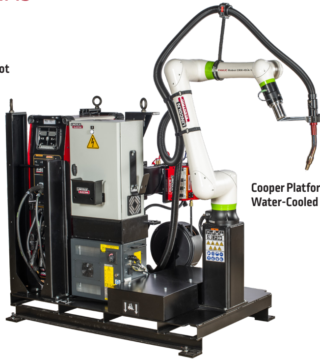
Cooper Platform CRX-10iA/L Water-Cooled Welding Cobot