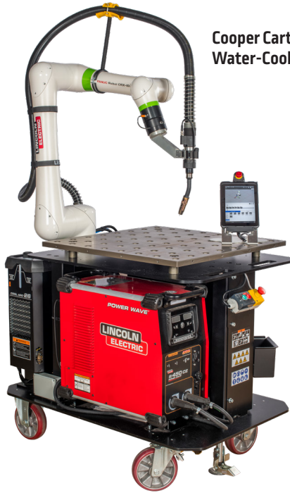
Cooper Cart CRX-10iA/L Water-Cooled Welding Cobot