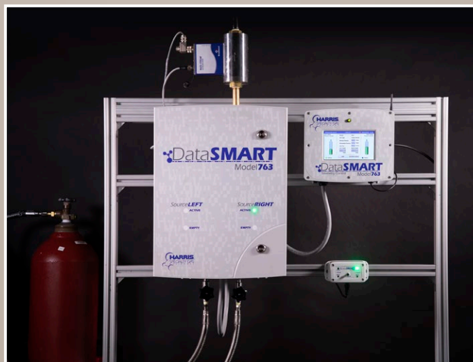
Fig. 3 Automatic switchover manifolds ensure a continuous supply of gas. Some systems, such as DataSMART™, provide detailed data on usage and other information to help users better manage gas consumption.

the reserve cylinder, but users could also easily program and adjust the changeover pressure settings for either side for further optimization. This would maximize gas usage and avoid sending cylinders back to the supplier with as much as 25% of the gas still left in them. DataSMART will feature a mass flow meter that will measure molecules of gas consumed in the process to determine gas usage.