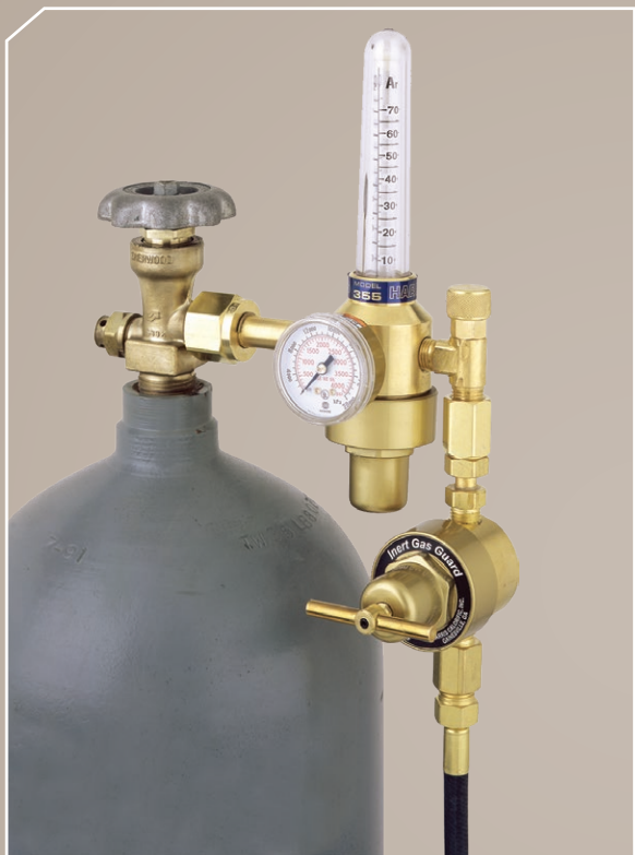
Fig. 2 A typical flowmeter regulator is a fixed pressure/variable orifice device. Pressure is set at the factory to a compensated or calibrated pressure, depending on the flow range desired and the gases being used.

conditions create the need for companies to seek out cost-saving measures. Therefore, there is a great deal of misunderstanding surrounding these products.