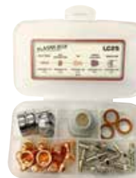
PLASMA-BOX LC25 W03X0893-118A