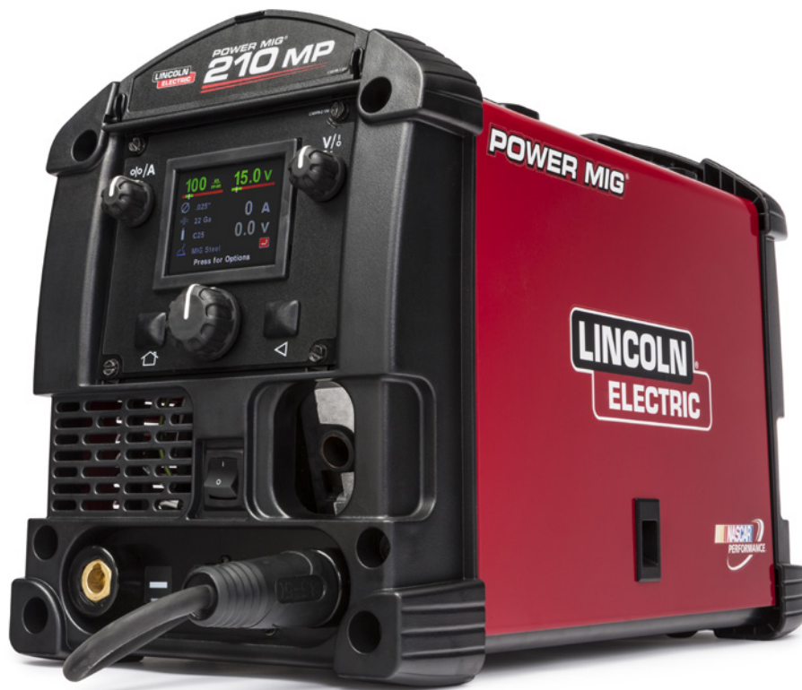
K3963-1 Power MIG 210 MP shown

The POWER MIG® 210 MP power supply is a multi-process welder for the hobbyist, educator or small contractor who wants to do MIG welding and a lot more, including stick, TIG and flux-cored welding. The push-and-turn digital controls and color display screen make setup and operation intuitive and easy, while the all-metal wire drive and sturdy sheet-metal construction make it rugged and ready for any job in the home or small shop. The POWER MIG 210 MP power supply is the ideal MIG machine for the welding novice, with plenty of room to grow as you gain more experience.