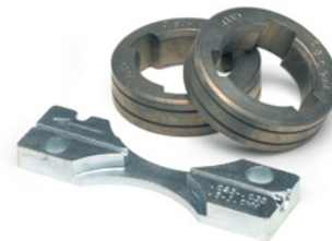
Shown: KP1697-035C, Cored Drive Roll Kit