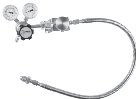
Shown with Model 741 Regulator Attached