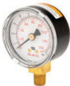
DELIVERY GAUGE 160 PSI Gauge 1/8" NPT M P/N.: 9017819