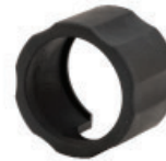
GAUGE GUARD Fits 2" Contents and delivery gauges P/N.: 9009931