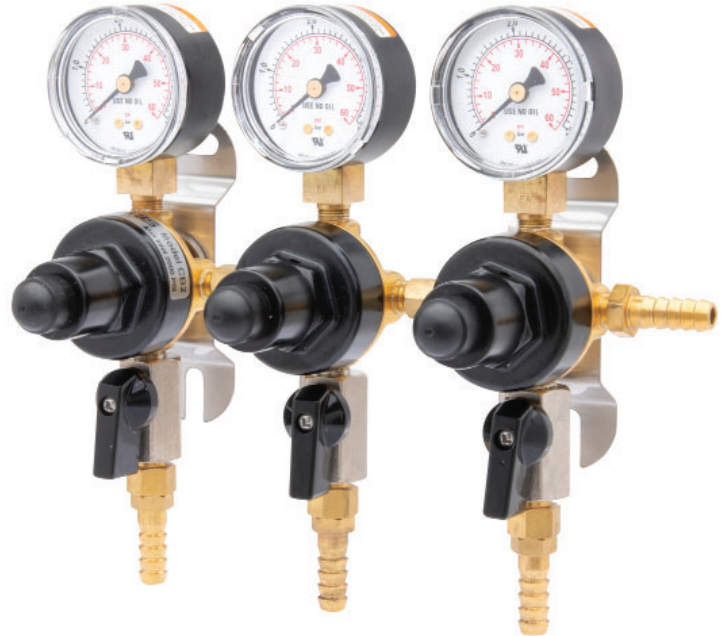
Shown: Secondary Regulator 3005225