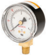
DELIVERY GAUGE 60 PSI Gauge 1/8" NPT M P/N.: 9017818