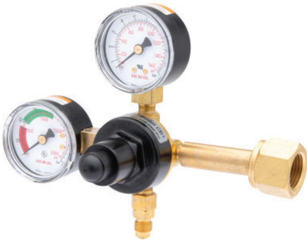
Shown: Primary Regulator 3005216