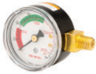
CONTENTS GAUGE 2000 PSI Red/Green 1/8" NPT M P/N.: 9017821