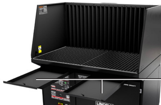
The lockable dust drawers for the second stage pre-filtration area are easily accessed from the front of the Prism Down Draft table.