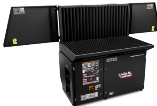
Left and right side panels swing open to allow for larger parts to be placed on the work surface.