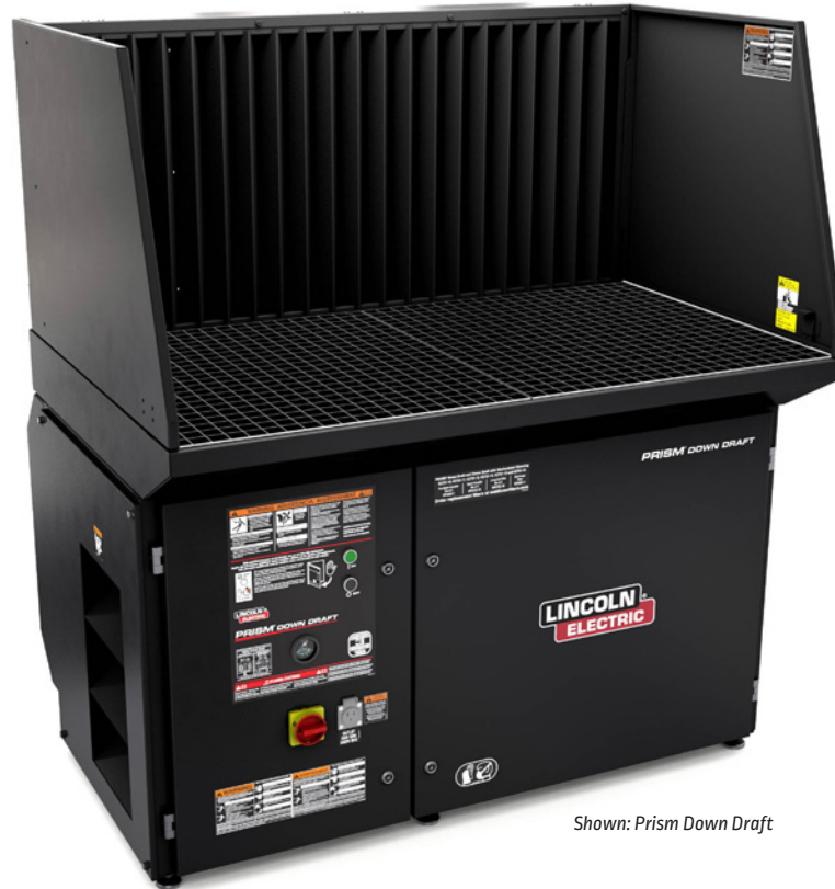
Shown: Prism Down Draft