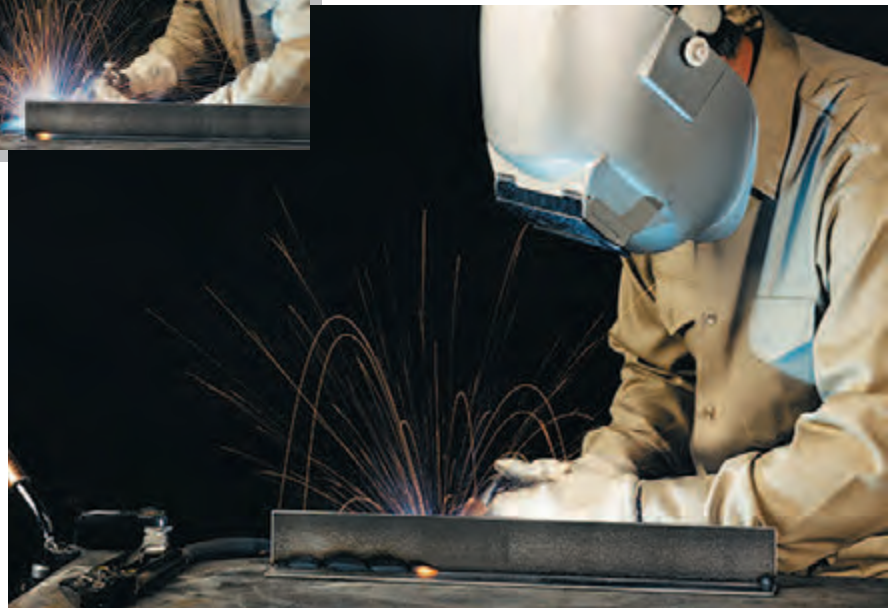
STT using CO 2 and .045" solid wire.