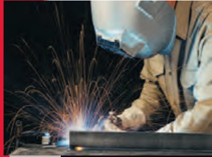
Conventional CV short circuit transfer using CO 2 and .045" solid wire.

Unlike standard CV GMAW machines, the STT machine has no voltage control knob. STT uses current controls to adjust the heat independent of wire feed speed, so changes in electrode extension do not affect heat. The STT process makes welds that require low heat input much easier without overheating or burning through, and distortion is minimized. Spatter and fumes are reduced because the electrode is not overheated—even with larger diameter wires and 100% CO 2 shielding gas. This gas and wire combination lowers consumable costs.