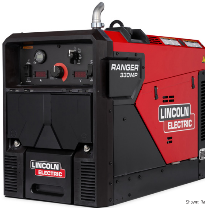
Shown: Ranger 330MP (K6005-1)