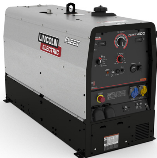
FLEET 400 K3427-2