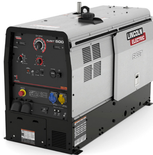
FLEET 500 K4338-2