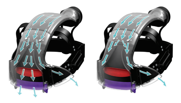
First baffle (Red) - controls ratio of air over forehead vs temples

The OMNIShield Face Shield PAPR features a unique, patented airflow design. The airduct is integrated into the top of the headgear and features two air flow baffles, which the user can adjust to change the direction and distribution of the set air flow. This feature maximizes operator comfort and helps prevent eye dryness.